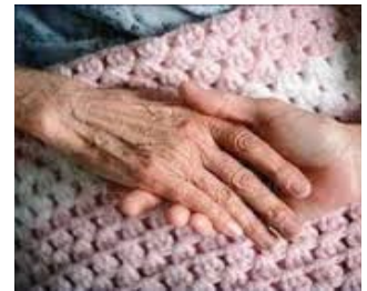
Improving End of Life Care in the Richmond Valley.

The End of Life Care (EOL) Project aims to improve the care we provide for our community in the Richmond Valley. The project continues to work in collaboration with acute and primary care services.